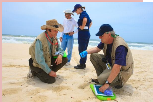
Shoreline assessment team

We played a central role in the development of the Mediterranean Guidelines on Oiled Shoreline Assessment. The project involved a comparative study on existing oiled shoreline assessment guidelines used around the world, followed by the production of Guidelines tailored to the Mediterranean Sea region.